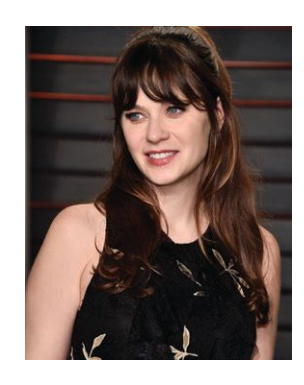
From top: Zooey Deschanel is the latest Hollywood A-lister to be seduced by Manhattan Beach; a newly built house in MB's coveted "Tree Section" (read: private!) just fetched $7 million.

Despite the fancy restaurants, one thing you won't be able to get in Manhattan Beach in the near future is a plastic straw. The city council just voted unanimously to move ahead with a ban on all plastics—including single-use straws—and those eco leanings extend into other areas as well. H'wood honcho James Cameron and producer-partner Jon Landau recently gave their Lightstorm Entertainment studios a total environmental makeover. Overseen by interior designer Lynda Murray, the 100,000-square-foot MB film studio now includes bamboo finishes, a massive solar panel system and all-vegan menu in its dining area. According to Cameron, his goal was nothing less than to build "the greenest set in Hollywood." Make that Hollywood, the sequel: Manhattan Beach! ■