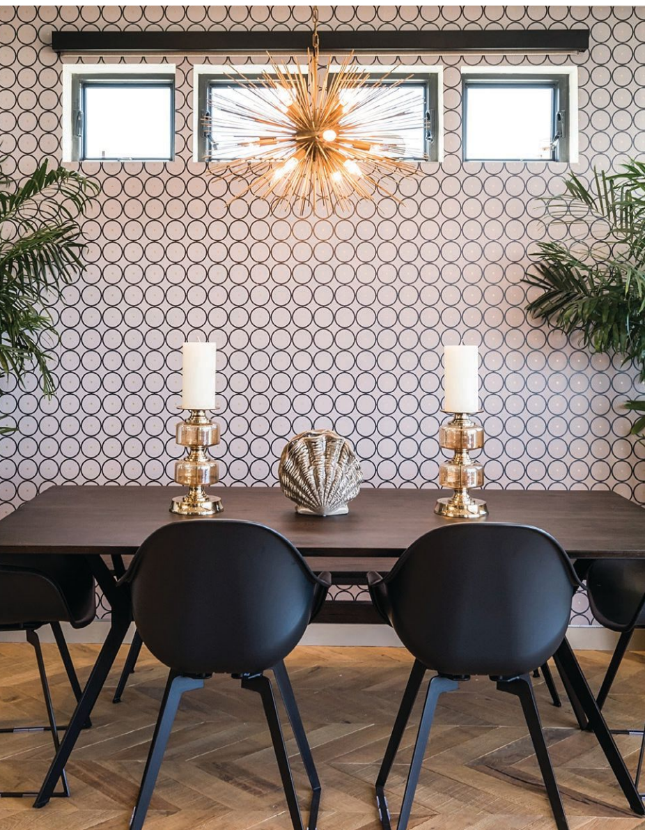
Clockwise from top: Industry A-listers are decamping to superchill but pricey Manhattan Beach, where even town houses like this are fetching between $5 and $10 million; after dining at one of the hot/haute spots in town, head to the pier to catch the sun going down; actor-producer Vince Vaughn was an early Hollywood defector to Manhattan Beach.