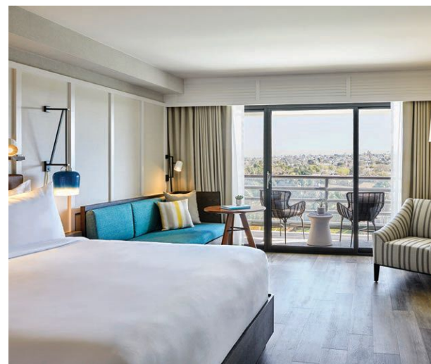
A suite fit for royalty: The King Suites at the buzzy new Westdrift boast views of manicured golf greens and the blue Pacific.