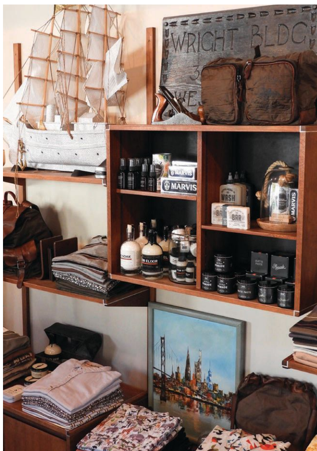
From top: Locals and out-of-towners alike are heading to Westdrift resort for the golf and happening new resto Jute; old-school-meets-cool boutiques like Wright's are driving shoppers to Manhattan Beach.