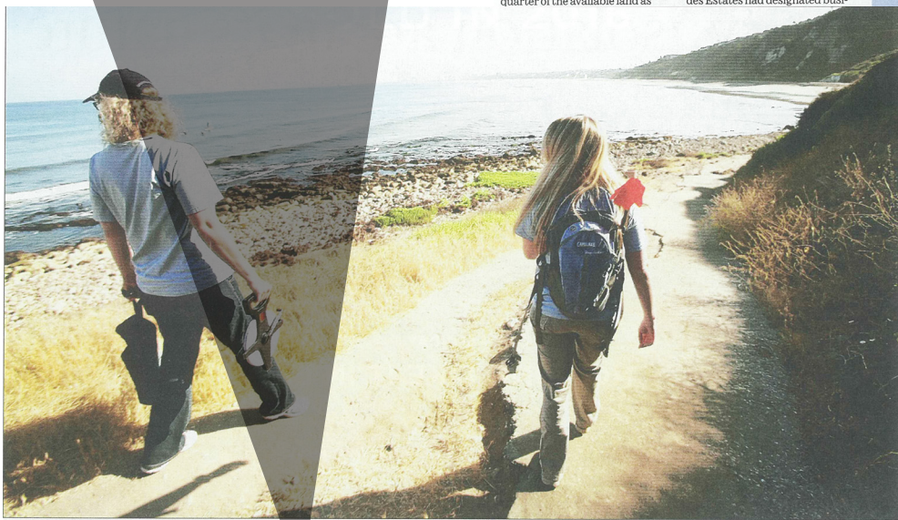
AL SEIB Los Angeles Times

Potential buyers need to do their homework, be prequalified and be ready to move quickly, she added. "You have two to three days to view it, make a decision and make an offer."